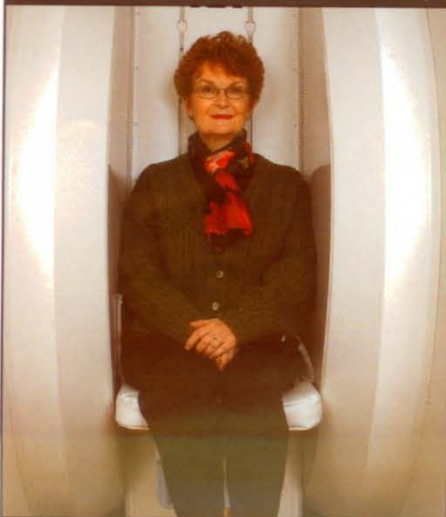
FONAR UPRIGHT™ MRI